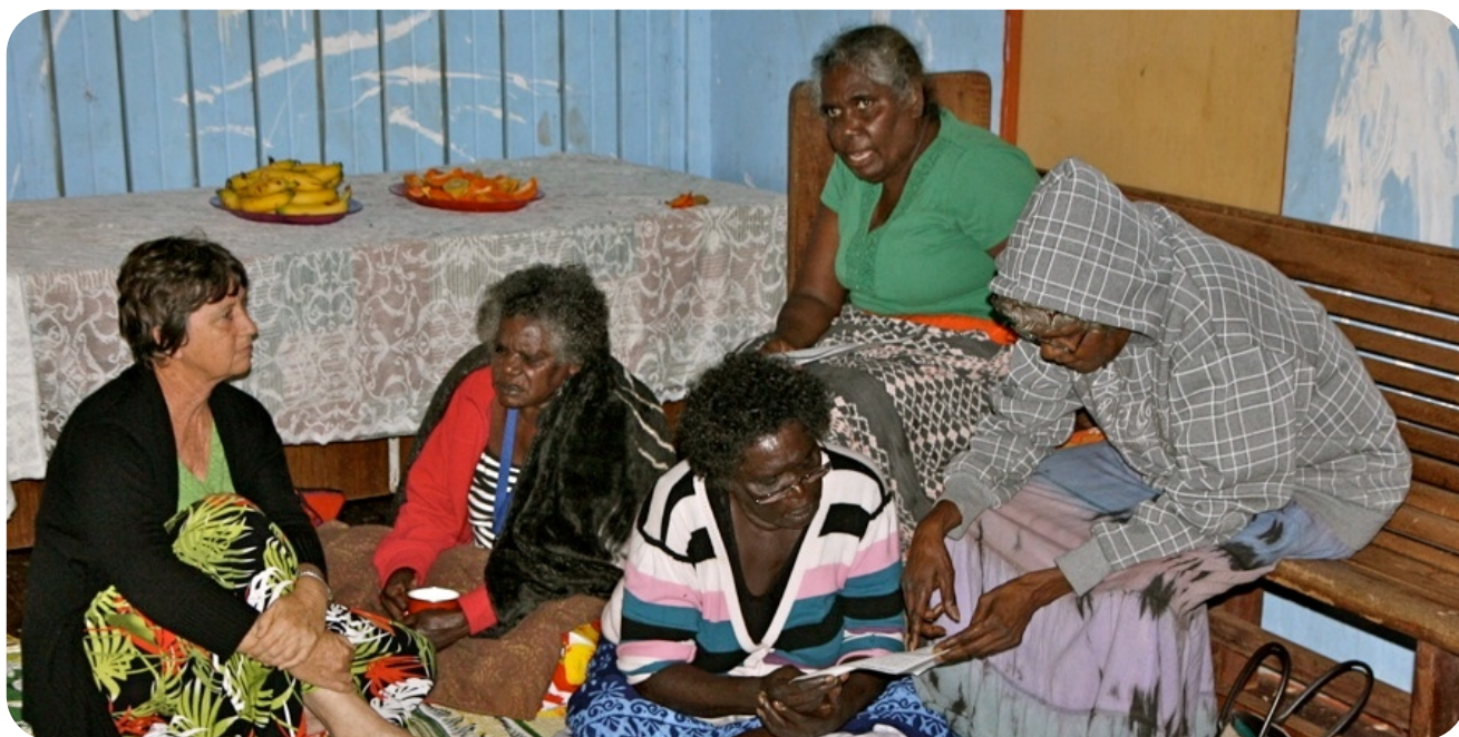
Bible Study Session in Yirrkala.